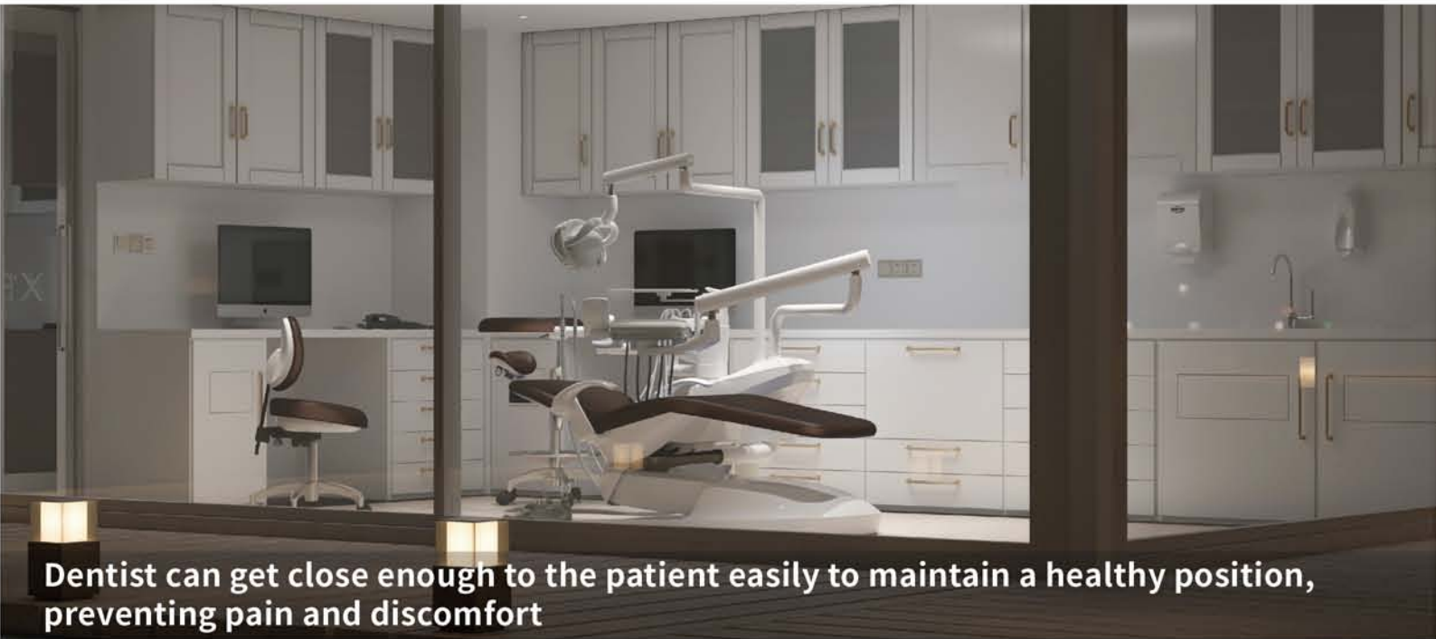
Dentist can get close enough to the patient easily to maintain a healthy position, preventing pain and discomfort