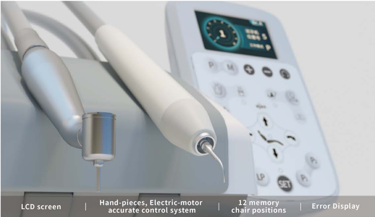
LCD screen | Hand-pieces, Electric-motor accurate control system | 12 memory chair positions | Error Display