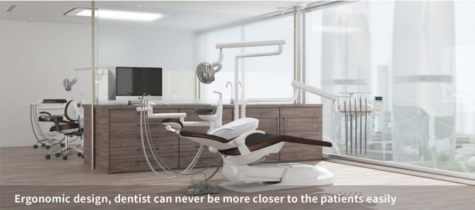
Ergonomic design, dentist can never be more closer to the patients easily