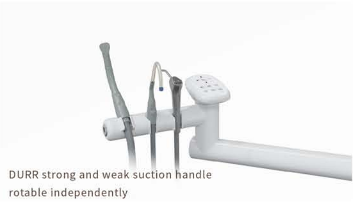
DURR strong and weak suction handle rotatable independently