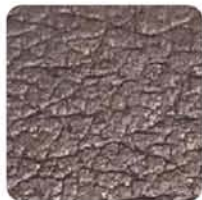
Wine Red 322-6558