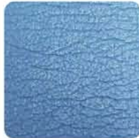
Sky Blue 554-2530