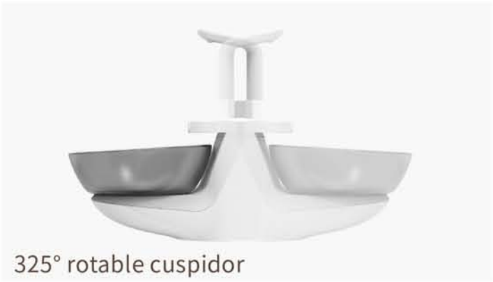
325° rotatable cuspidor