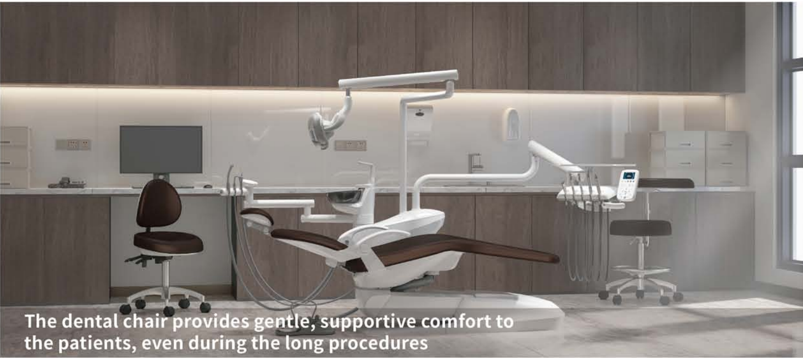
The dental chair provides gentle, supportive comfort to the patients, even during the long procedures