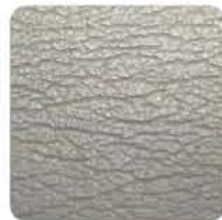
Brown grey 554-3087