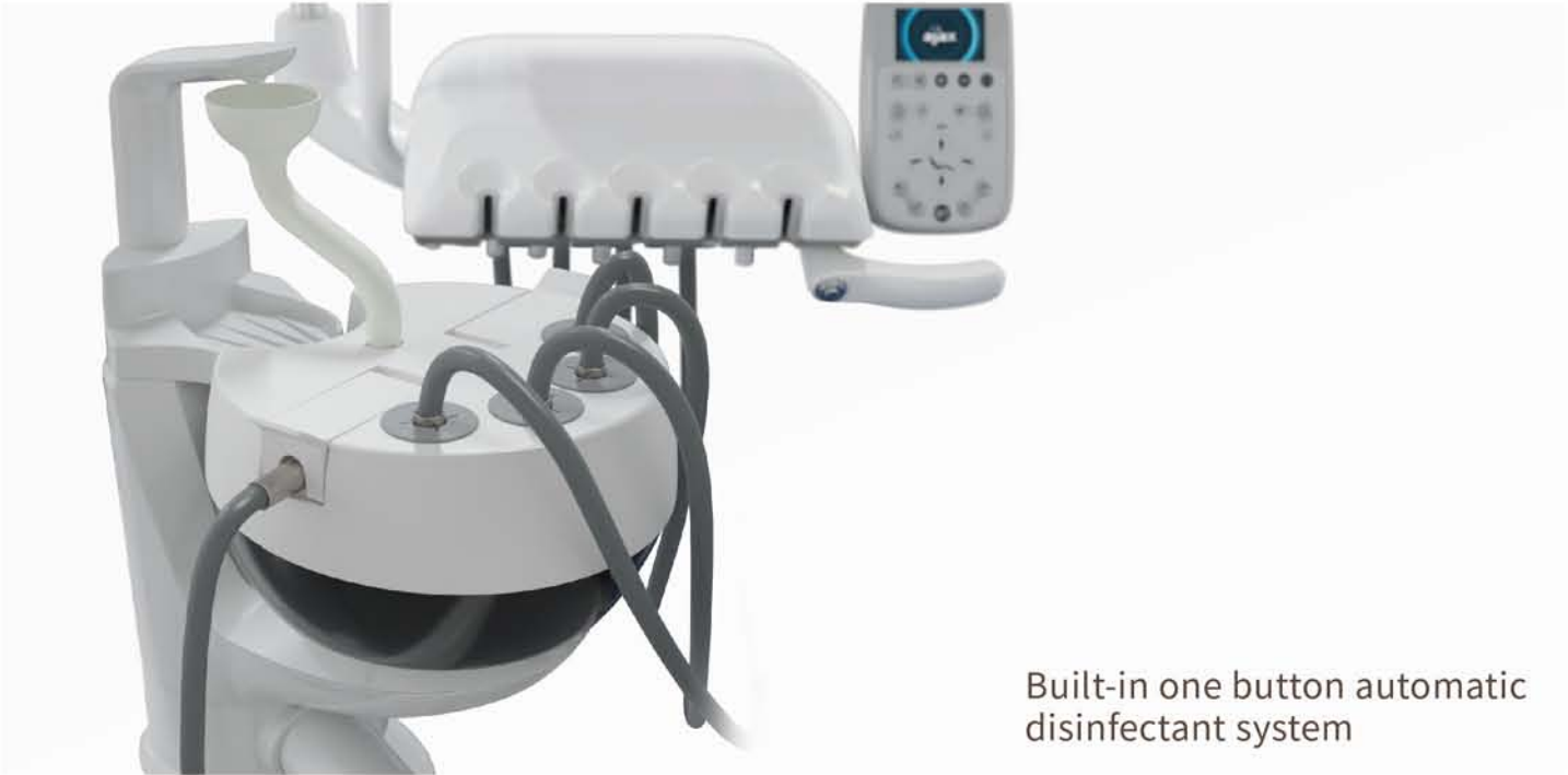
Built-in one button automatic disinfectant system