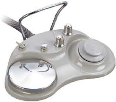
Multi-function foot control paddle Including chair position control, instrument panel control, Rinse and cup filling control.