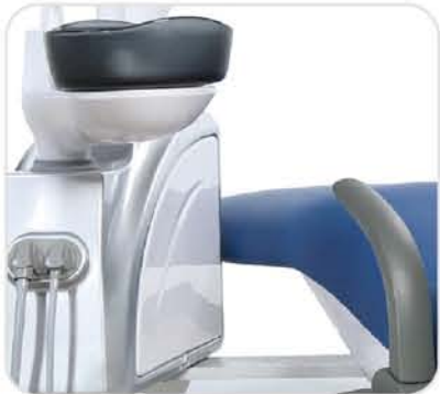
Rotatable water unit Design for four-hand operation, easy maintenance.