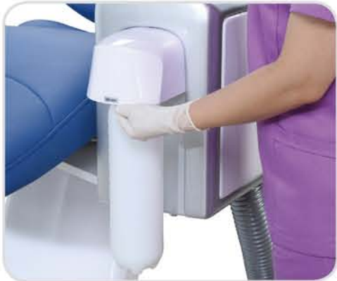
Water bottle one switch control Replace two switch control, make operation easier.