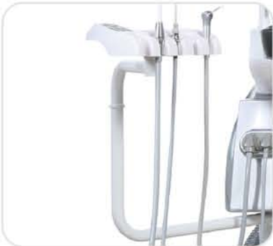
Double pivot arm for assistant table It is easier for assistants to find a suitable working position.