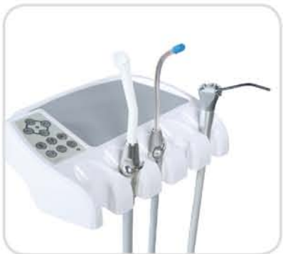
Multi-function assistant control panel Ten different control functions help assistants use the dental chair more effectively.