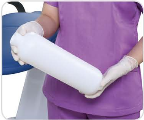
1.5L water bottle Provide enough water for dental chair, reduce the frequency of replacement for better disinfection.